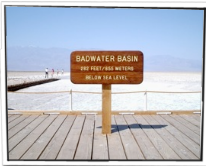
Figure 1: Badwater Basin in Death Valley California