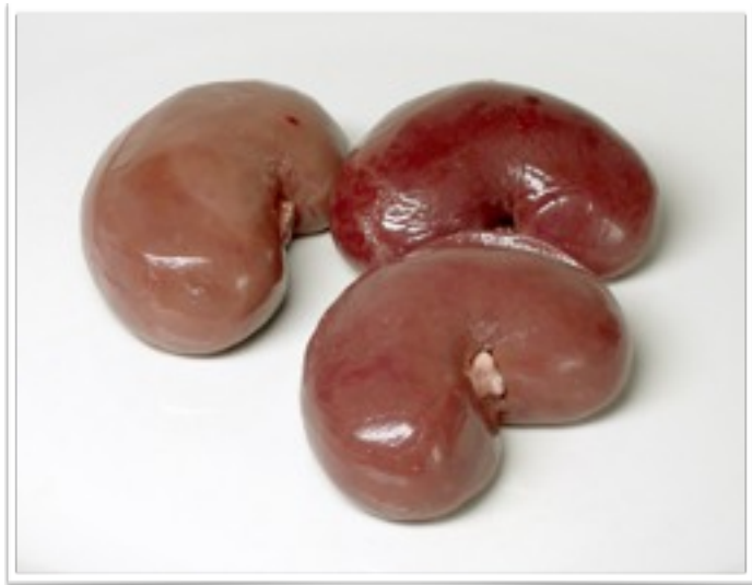
Figure 1: Lamb Kidneys

The human body carefully regulates its water content because imbalances in water content can lead to severe illness and death. There are a host of mechanisms in the body to regulate water levels but the organ with the main responsibility is the kidney. Kidneys have the ability to excrete more or less water in the form of urine. When the body becomes very dry the kidneys will concentrate urine (decrease water content) so that the urine becomes very dark. Conversely, if you drink a great deal of water you will urinate a lot and your urine will be very clear (high water content). There are some